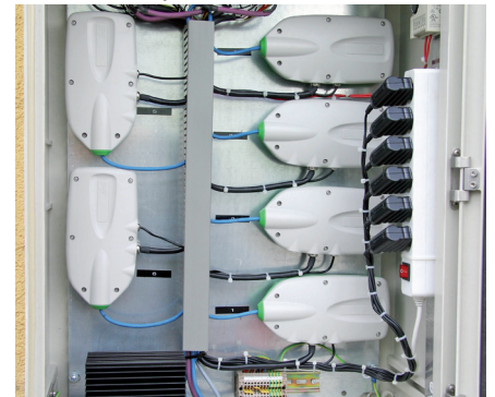
EE30-EX switching cabinet

In many cases, too few (often only one) humidity measuring transducers are used. Because of this, critical zones are not detected. However, it is often important to install humid-