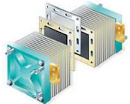
Fig. B - Fuel cell stack

In order to obtain a reasonable level of performance from the fuel cell, a large number of separate membrane-electrode components must be combined to form a fuel cell stack