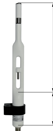
Wall/pole mount by means of a mounting clip Accessory HA010227