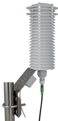
Mounting in a radiation shield Accessory HA010511

The probe shall be mounted vertically with the filter cap upside, a proper air circulation around the probe must be ensured (e.g. with HA010511). Please avoid any improper mechanical stress onto the probe.